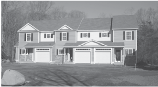
OLD SAYBROOK $299,000

NEW Condo Complex. 1389 sqft units with garage. Stainless steel, energy efficient appliances and granite countertops. Each of the 2 bedrooms has its own bath plus a 1/2 bath on first floor. Walk to YMCA. Joe Wren 860-202-0693. FOR DETAILS VISIT: www.Ethans-Landing.com .