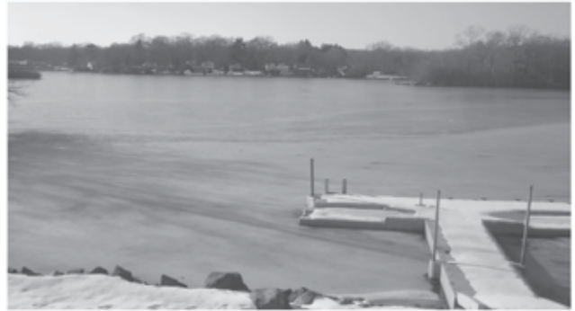
OLD LYME $259,900

NEW Condo Complex. 1389 sqft units with garage. Stainless steel, energy efficient appliances and granite countertops. Each of the 2 bedrooms has its own bath plus a 1/2 bath on first floor. Walk to YMCA. Joe Wren 860-202-0693. FOR DETAILS VISIT: www.Ethans-Landing.com .